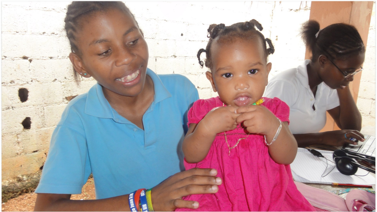
A recent arrival