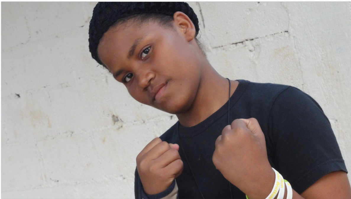
She's not combative-just an actress (she broke out laughing as soon as I snapped the shutter)