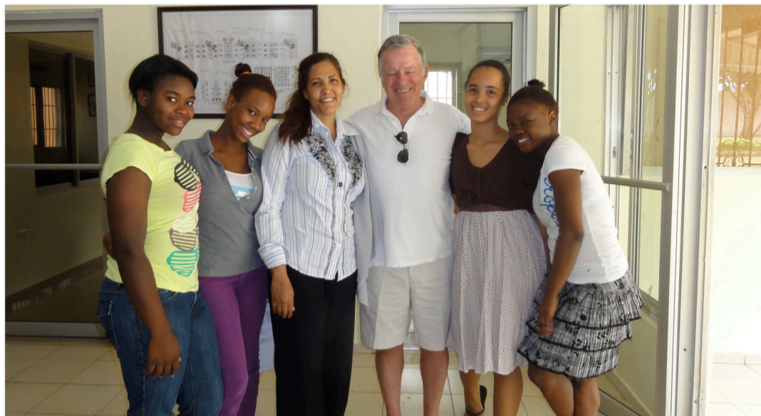
Sonia looks younger as the girls get older